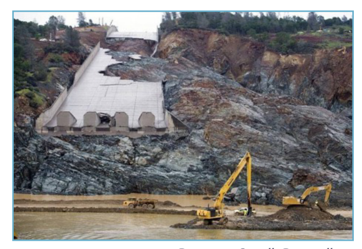
Damage at Oroville Dam spillway.

Whether repairing the spillway for the tallest dam in the United States, the Oroville Dam, or dealing with any one of many projects they're working on at any given time, the licensed engineers, land surveyors, and geologists of California are expected to adhere to professional responsibility guidelines set by the Board.