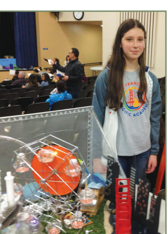
Student participants at the Future Cities Competition.